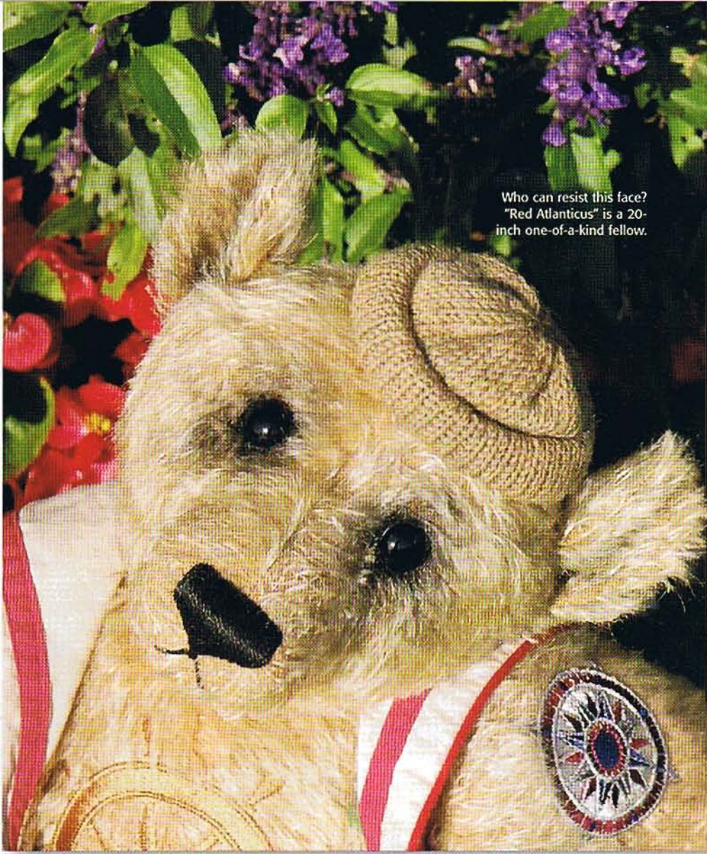
Who can resist this face? "Red Atlanticus" is a 20-inch one-of-a-kind fellow.