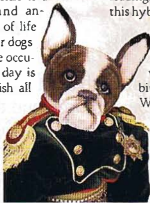
Right: "Fagin" is an 18-inch one-of-a-kind that is regal and stately.

"The Dufeu bears are very appealing and have a bit of a terrier look to them. We so often find that the larger bears can be a bit serious-looking and have a Steiff appearance to them. The Dufeu bears are unique in their designs. They are extremely well-dressed in