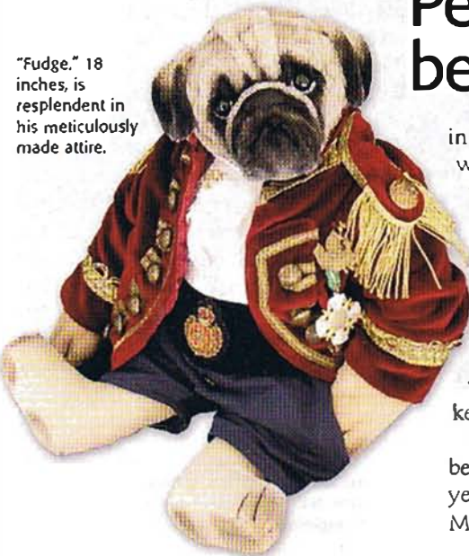
"Fudge," 18 inches, is resplendent in his meticulously made attire.

in my fantasies, he was born in Cornwall and grew up there. It's no surprise that he still looks like an English landlord. Sometimes when we are drinking a cup of tea, he tells me stories about his country life in good old England. He makes me very happy!"