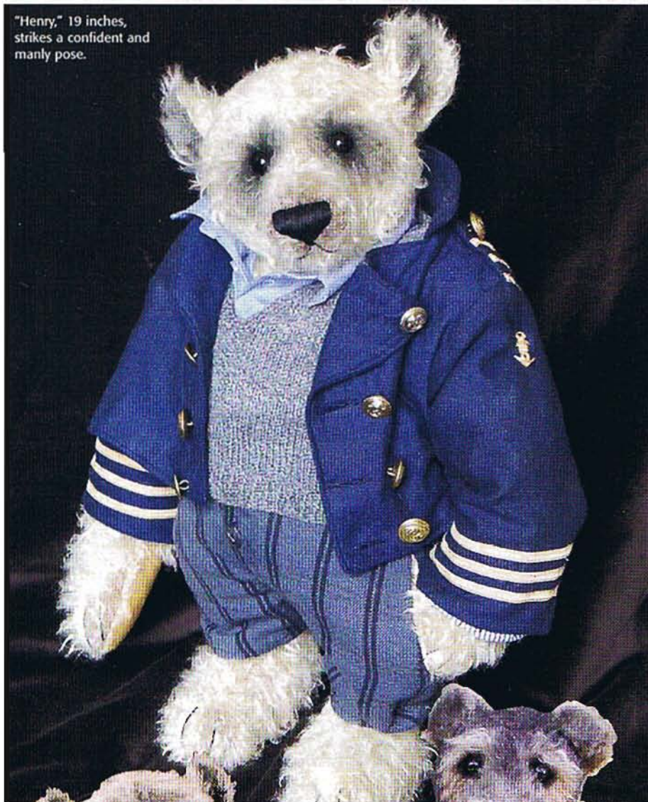
"Henry," 19 inches, strikes a confident and manly pose.